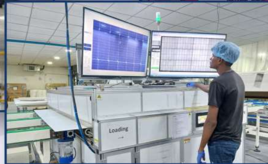
ADVANCED EL PROCCSS