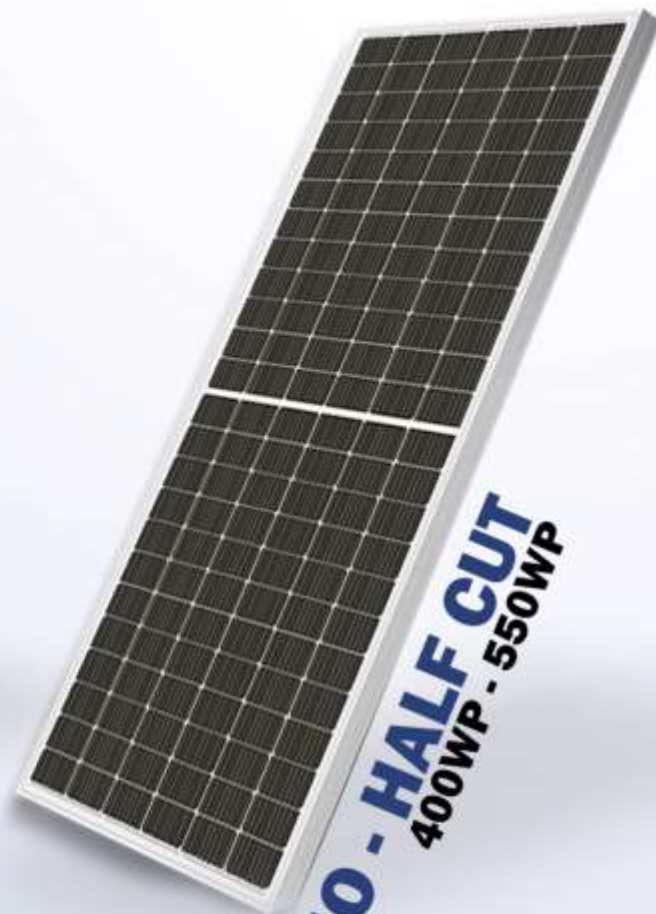
MONO - HALF CUT 400WP - 550WP