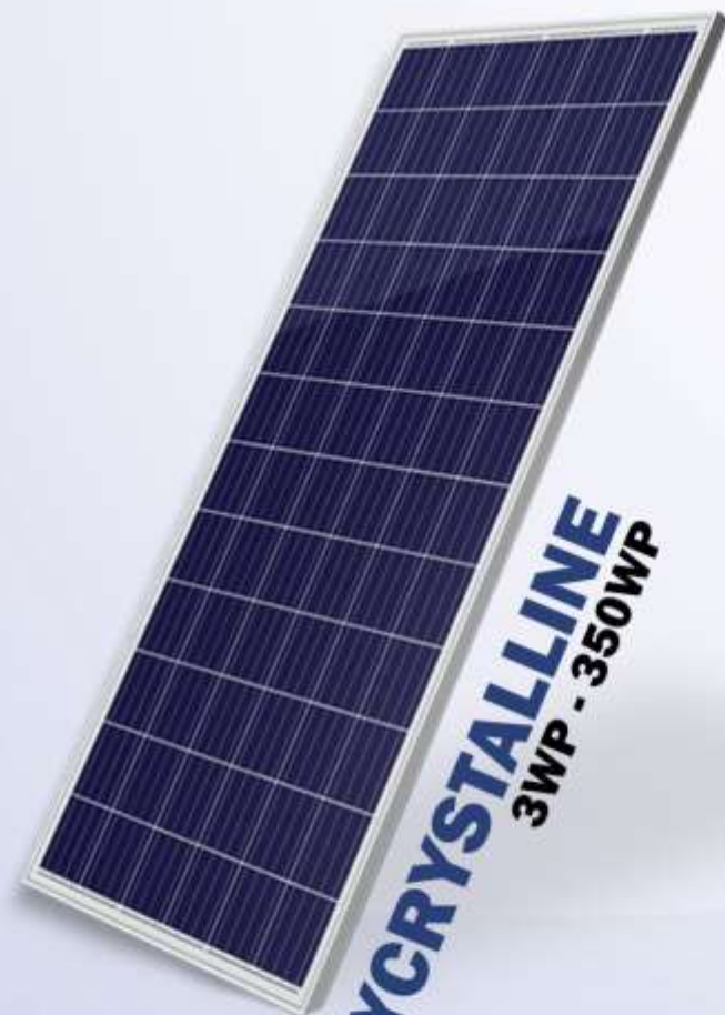
POLYCRYSTALLINE 3WP - 350WP