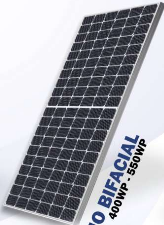
MONO BIFACIAL 400WP - 550WP