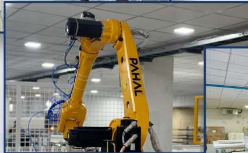
AUTOMATED COMPOSITE LAY-UP