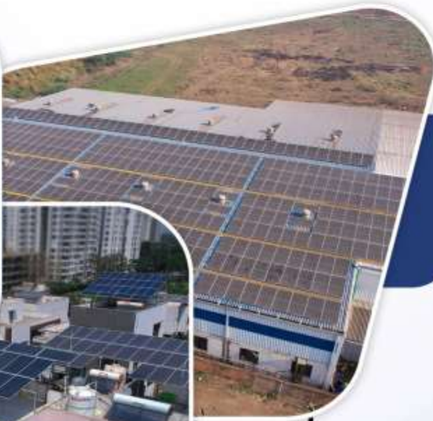
COMMERCIAL & INDUSTRIAL