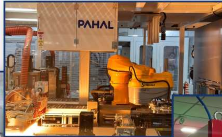
ADVANCED MBB STRINGER

PAHAL SOLAR Solar PV Module Manufacturer