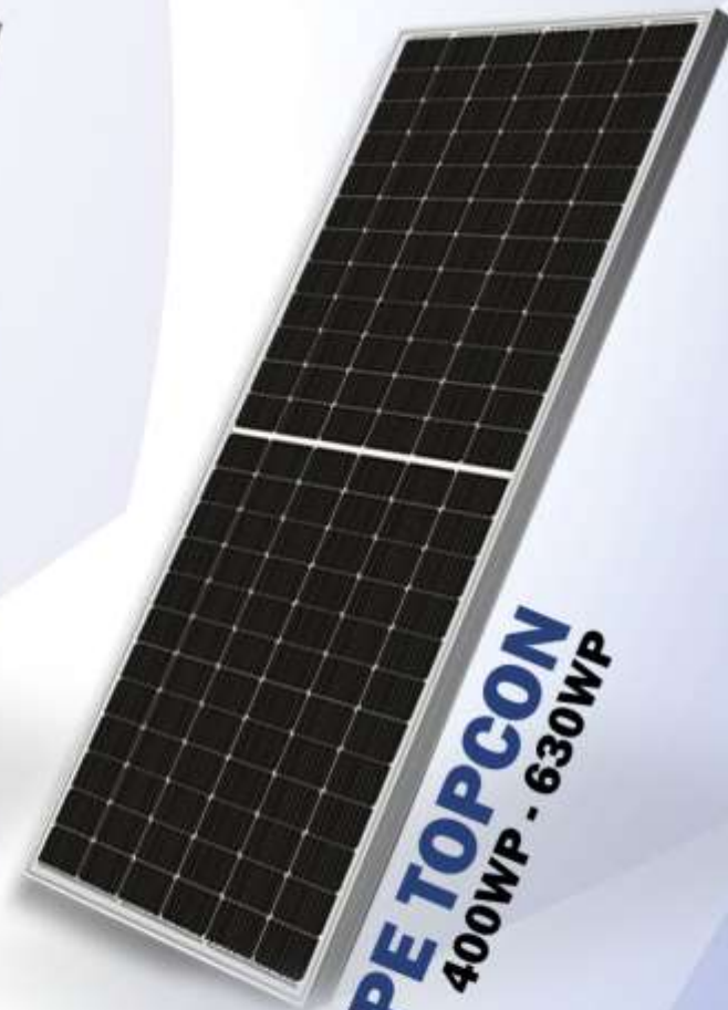
N-TYPE TOPCON 400WP - 630WP